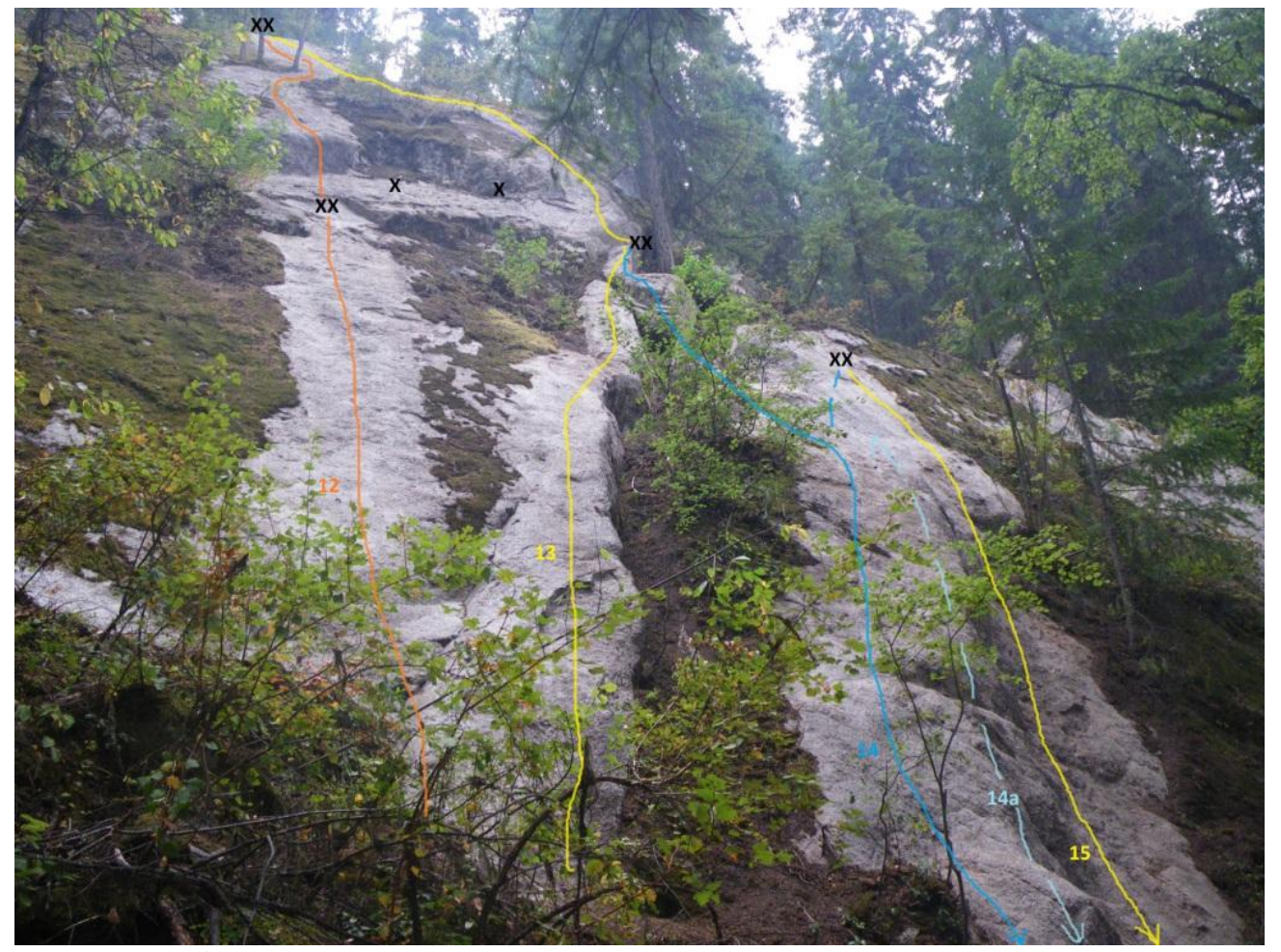
THUNDER DOME This area is just past Jubilados and has two single pitch climbs and two 2 pitch climbs on similar rock. Difficulty is about the same as the other areas (described from left to right): The right and left upper pitches feature the most challenging (~5.8) slab moves on the entire crag, but the cruxes are fairly short and well protected. It is like the "graduation cliff" for those who have been learning to climb on the easier climbs on Fraggle and Jubilados.