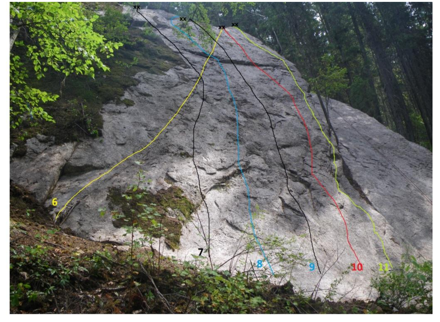
JUBILADOS SLAB (the "middle zone" to the left of Fraggle Rock

(7 bolts, about 22 m) - all climbs angle to the right in the bottom half, then are more vertical after the small "overlap" mid-cliff (except Vagabondo). The climbs generally are more difficult going from left to right Difficulty ranges from 5.5 to 5.7. The first bolt on some climbs may seem high but there are very positive holds once you are off the ground.